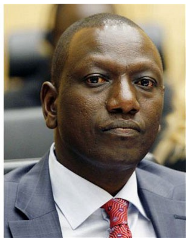
Senior Kenyan figures facing International Criminal Court trial Uhuru Muigai Kenyatta and William Samoei Ruto