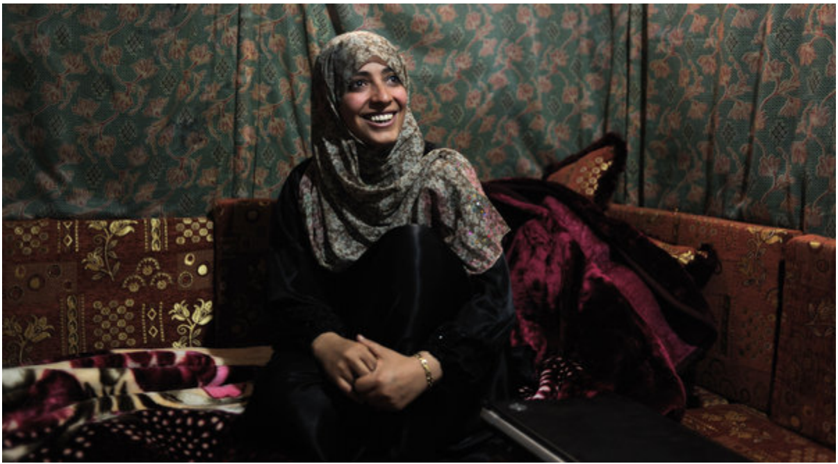
Tawakkol Karman, a Yemeni Nobel laureate, sought justice in the International Criminal Court for protesters killed in an uprising.