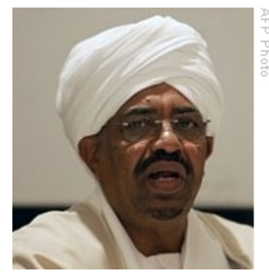
Sudan's President Omar al-Bashir (file photo)

African member states of the International Criminal Court are considering a mass withdrawal to protest the war crimes indictment against Sudan's President Omar al-Bashir. A pullout is unlikely, but many are demanding a one-year suspension of the indictment.