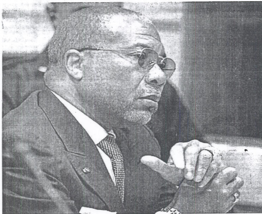
Former President Charles Taylor