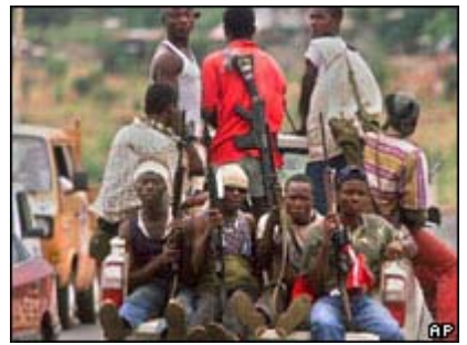
The Kamajor militia supported the government in the civil war

Some 50,000 people were killed and many more maimed and raped during the war.