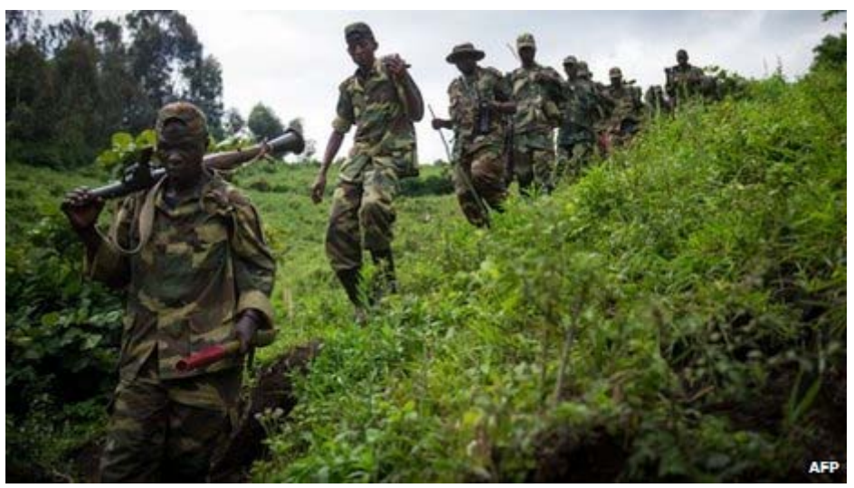
M23 fighters launched a rebellion last May, forcing 800,000 from their homes

Rwanda has strongly rejected allegations that it is helping train child soldiers for rebels in the Democratic Republic of Congo.