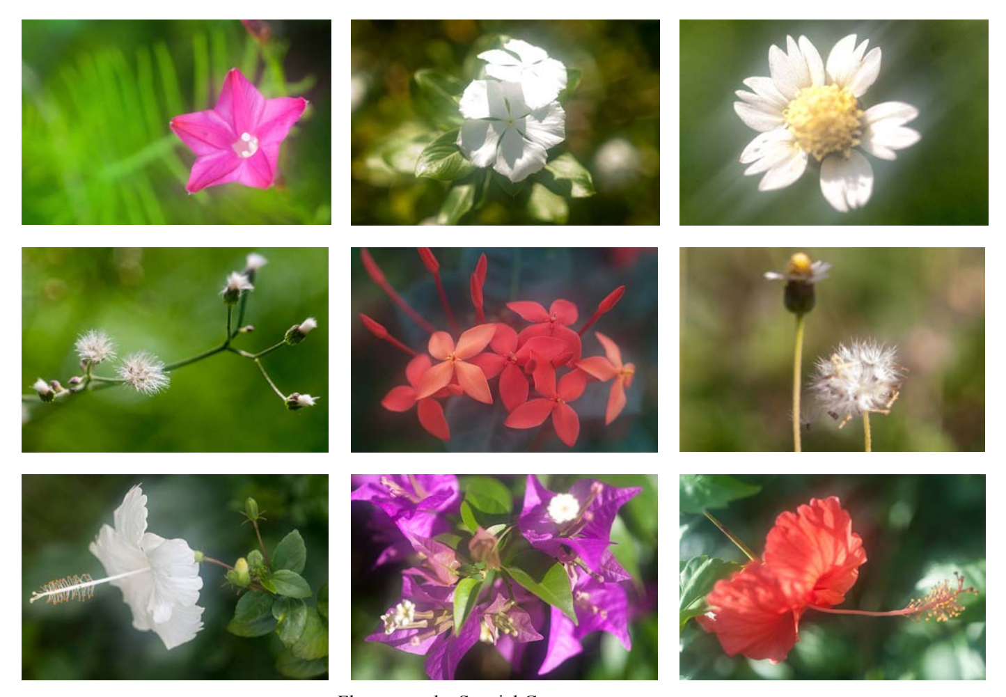
Flowers at the Special Court