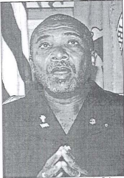
Former Liberian President Charles Ghankay Taylor